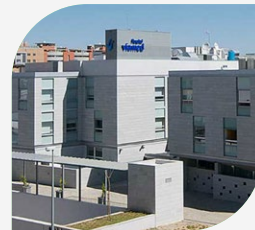
Viamed Santa Ángela de la Cruz Hospital