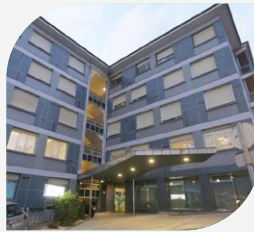
Virgen Blanca Clinic