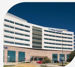
Vithas Sevilla-Aljarafe Hospital