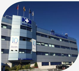
Madrid Norte Sanchinarro Hospital