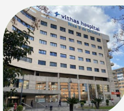
Vithas 9 de Octubre Hospital