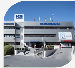
Madrid Montepríncipe Hospital