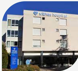
Vithas Pardo de Aravaca Hospital