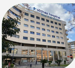
Vithas 9 de Octubre Hospital