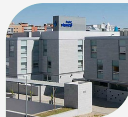
Viamed Santa Ángela de la Cruz Hospital