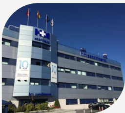
Madrid Norte Sanchinarro Hospital