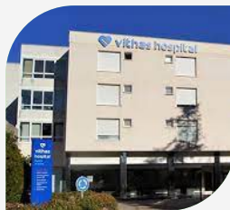
Vithas Pardo de Aravaca Hospital