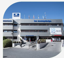
Madrid Montepíncipe Hospital